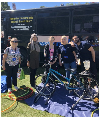
Above: HALE staff offering healthy alternative to Slush Ices with their Smoothie Bike and Sports Games